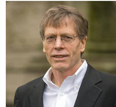
Lars Peter Hansen

This world-renowned economist is a senior fellow at Stanford University's Hoover Institution who writes "The Grumpy Economist" blog from a free-market point of view. Cochrane is the Daniels School's first Dean's Distinguished Lecture speaker; he will visit campus to talk about inflation and more Oct. 1.